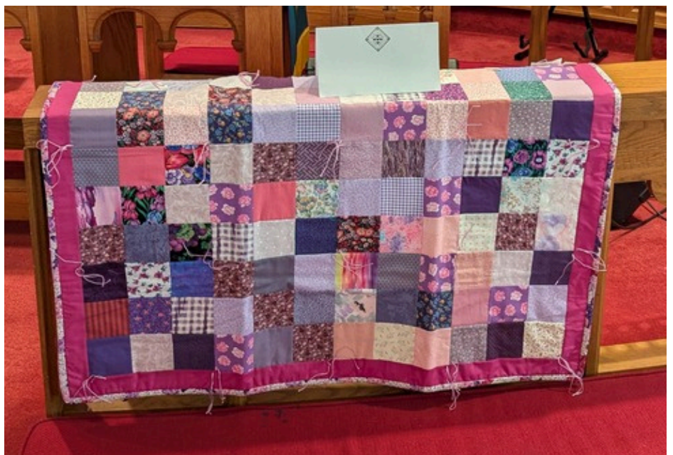
A prayer quilt placed on the altar during Sunday worship service.

If you enjoy sewing and like pretty fabric and the fellowship of like-minded people you would enjoy this group.